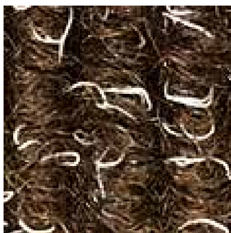
Brown no. 485