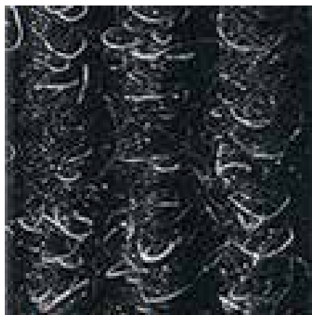
Anthracite no. 200