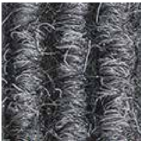
Light grey no. 220