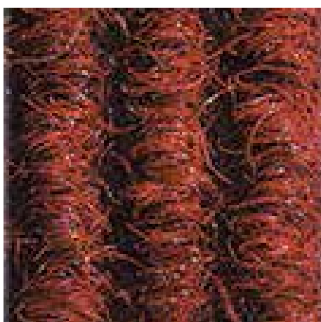
Red no. 305