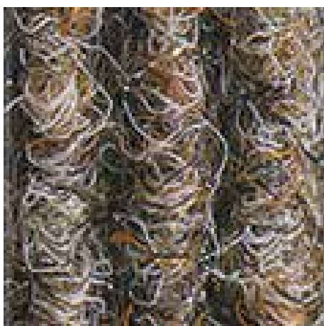
Sand no. 430