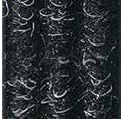
Anthracite no. 200