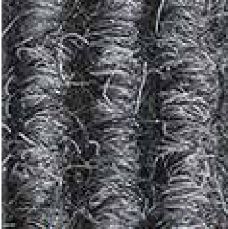
Light grey no. 220