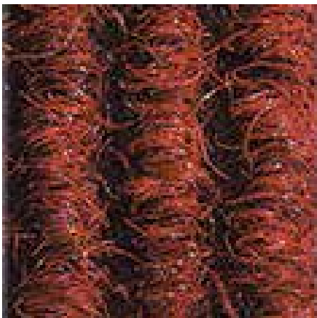
Red no. 305